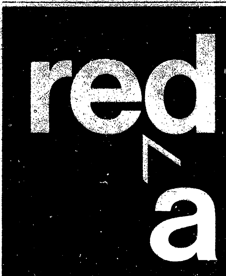
One of ALA's 1975 National Library Week Graphics